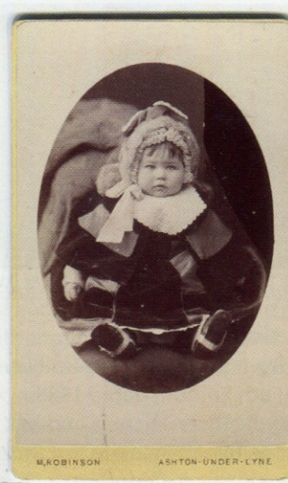
Baby's dress tied to her shoes (cdv c1877 Ashton-under-Lyne)