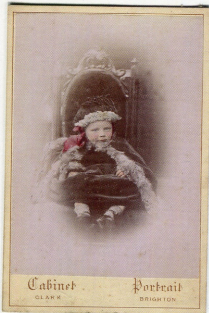
Hand colouring instructions - blue eyes, dark eyebrows & light hair (cab c1875 Brighton)