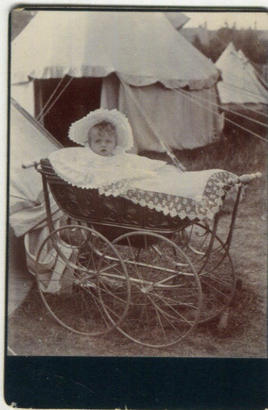
Tucked up in a magnificent pram and lovely lace (cab c1895 Unknown)