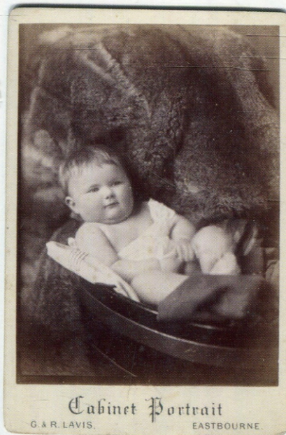
Chubby chap (cab c1886 Eastbourne)