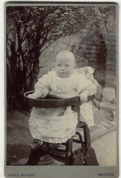
Feeding time in a mechanical chair (cab 1897 Sheffield)