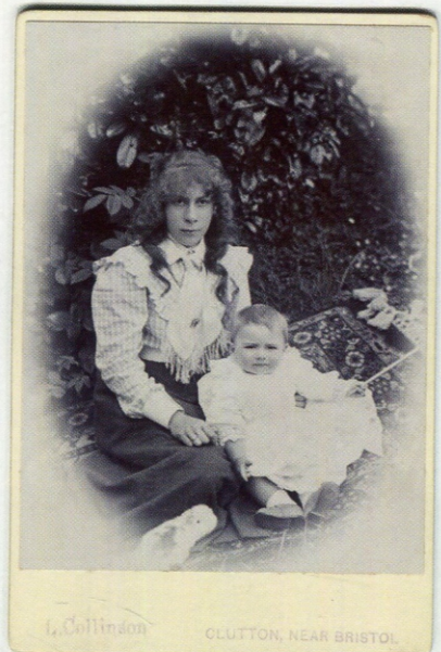
Nice informal portrait by a lady photographer (cab c1907 Clutton near Bristol)

You can find more of these wonderful images on the dedicated page on the PCCGB website: https://bit.ly/3NZ8yDx