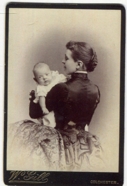
Perfect pose to show off baby (cab c1891 Colchester)