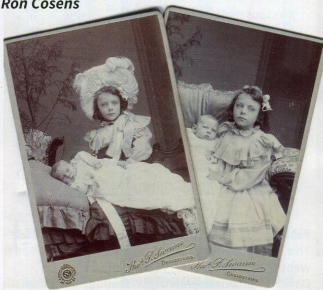
A lovely and loving big sister