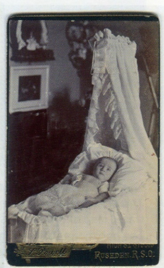
At Home portrait in a lovely crib (cdv c1897 Rushden)

Following on from the last edition – weddings – perhaps we should look this time at babies.