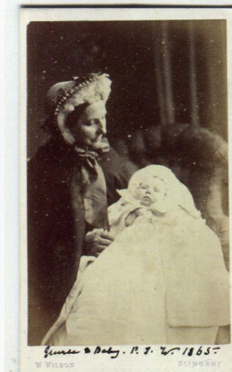
Nurse & baby (cdv 1865 Slingsby)