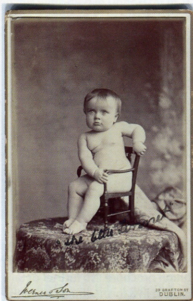
Rare photograph of a naked Victorian baby