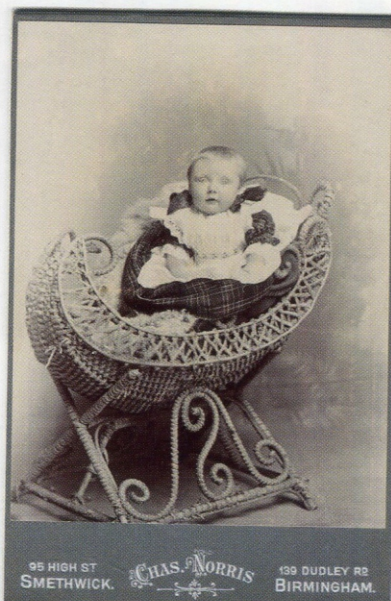
Portrait in a special baby chair (cab c1905 Birmingham)