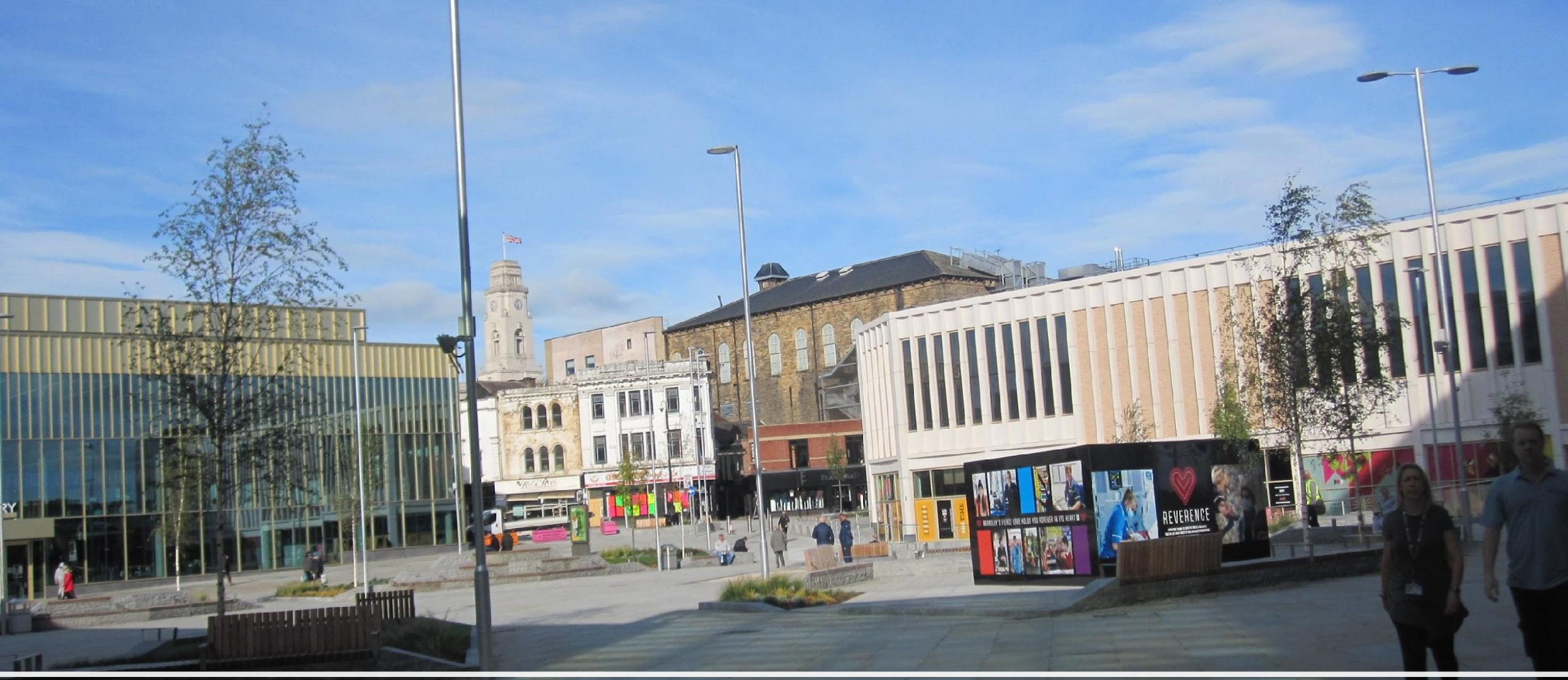
Barnsley. More new town centre, the Heritage Action Zone in the background.(EldonSt)