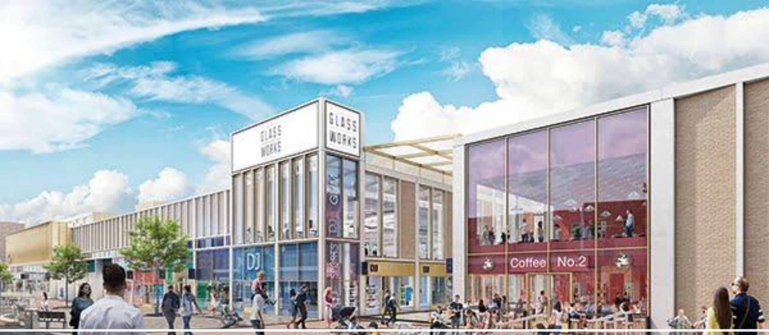
Barnsley. The new town centre. Opened Summer 2021.