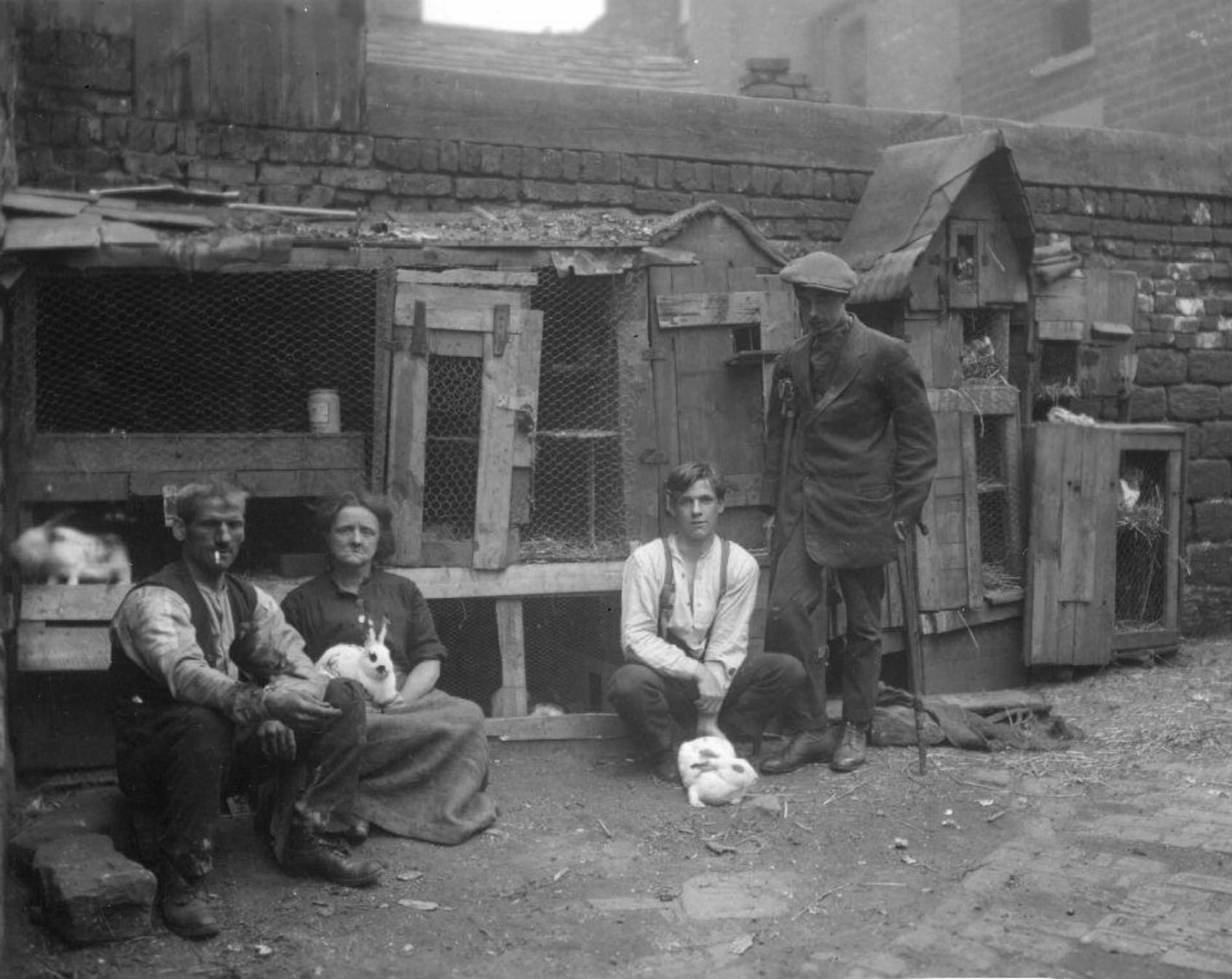
Barnsley slum housing in 1930s.